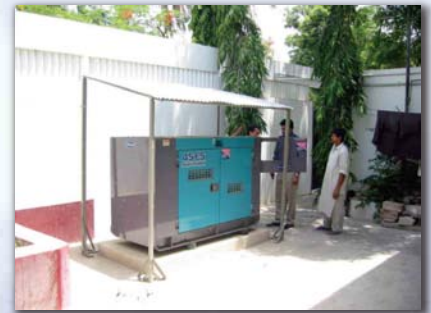
As the Emergency power source in the hospital.