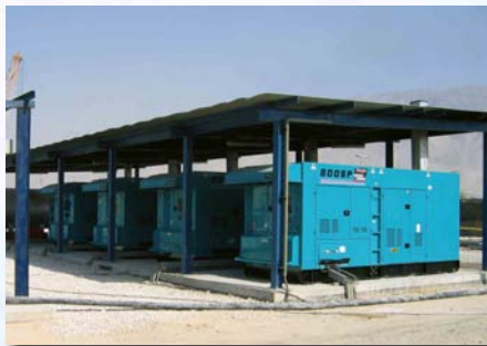
As the power source in the area where electricity is unavailable.