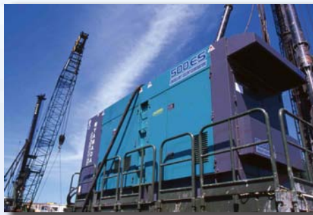
As the power source in the construction site.